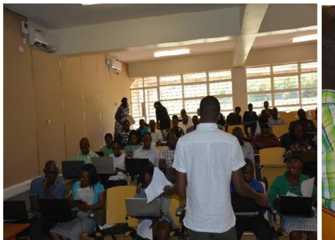
Figure 1: SCRECU Team Conducting Training of REC Admins and IT Personnel

and subsequent monitoring of approved studies by research ethics committees in Uganda.